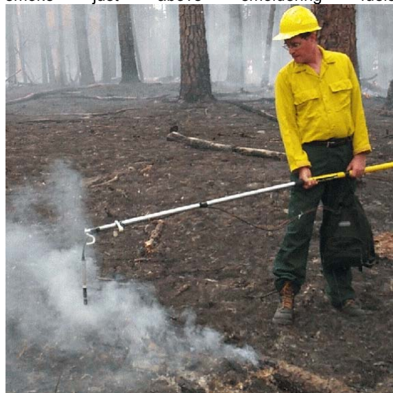
Figure 2. Sampling the temperature and relative humidity of smoke on 18 March 2002 at a prescribed burn site located at the Hitchiti Experimental Forest in central Georgia.

The moisture excess hypothesis was tested as follows. A Vaisala temperature and relative humidity probe was affixed to a pole and immersed in residual smoke just above smoldering fuels.