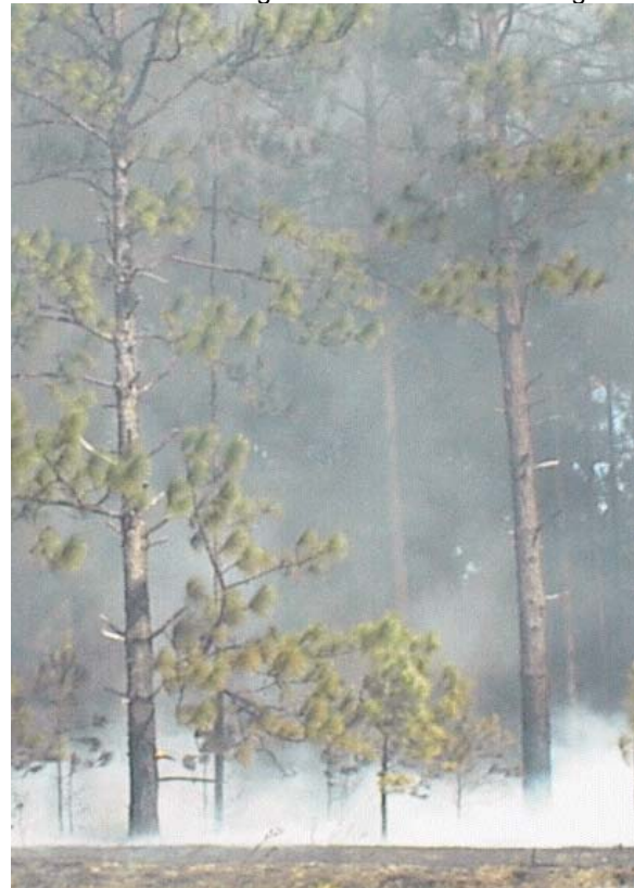
Figure 1. Superfog photographed during a prescribed burn in South Carolina in 2001.

Reports of exceptionally dense fog (“superfog”) with visibilities estimated in fractions of a meter (feet), have been filed by state troopers while investigating accidents. However, because the accident locations are unpredictable and remote, and accidents usually occur near sunrise, it has not been possible for smoke scientists to take observations because the fog typically dissipates shortly after sunrise. Thus, the connection between superfog and smoke, though plausible, has not been empirically verified – either through observations or modeling.