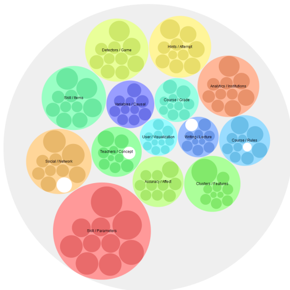
Figure 3: Overview with highlighted keywords and corresponding paper list