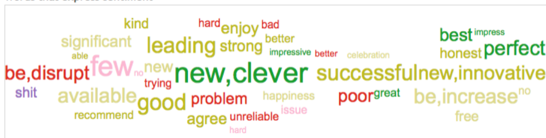
Figure 1 Concept cloud representing how sentiment about objects is expressed. Size represents number of opinions; colour represents tonality as in next figure.