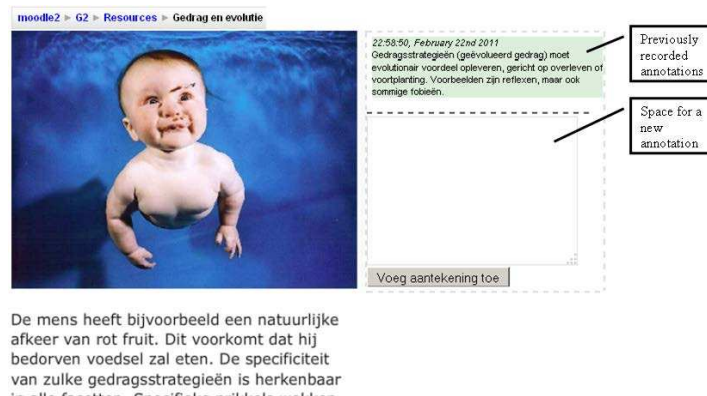
Figure 1. An annotation in its local context of a standard Web page of the course

The digital annotation tool was a comment box displayed on each page (Fig.1). It kept record of all annotations produced by the learner on this very page. The annotation tool unfolded through a click by the learner. Consistently with the length of the reading material and the action requested from learners (frequent but short notes), the surface of the tool was intentionally not large and its function deliberately restrained to the basic typing. As for pedagogy, the annotation tool was offered to promote analytical scrutiny and internalization of the learning material’s meaning by making it possible for learners to capture, within the study task, the gist of what has been read.