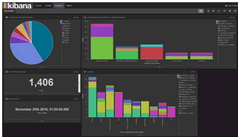
Fig. 3. Visual dashboard located in the Kibana website.

As an example, Fig. 2 and Fig. 3 show a set of analytics for job offers collected from the different professional networks that our expert system supports. In both figures, we can observe the ten provinces with more job offers. In this case, Madrid and Barcelona are the cities with more job offers. The second graphic is related to number of categories and subcategories of job offers. The “commercial_y_ventas” category is the one with more job offers and, as the most popular subcategory, we have “comercial”. In Fig. 3, we can observe additional graphics, and other relevant information, such as the amount of job offers located in the system, and the date of the last offer captured by the system.