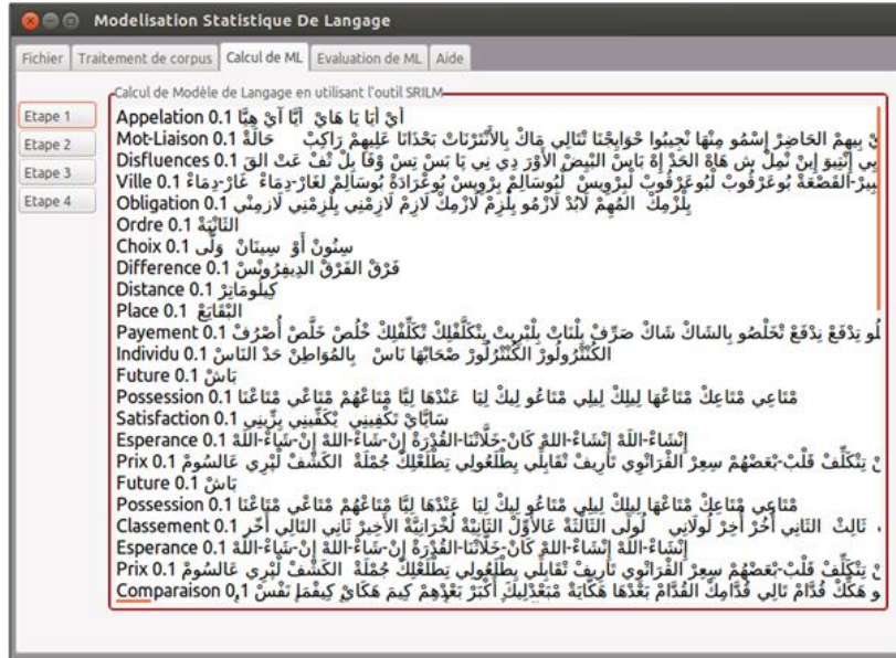
Fig 2. Prepared corpus extract

• Language model calculation: In the language model learning corpus, including dialogue transcripts, all words (or semantic blocks) are replaced by class names. Finally, we use the SRILM 2 toolbox to learn language model including semantic classes. SRILM is a toolkit for building and applying statistical language models, primarily for use in speech recognition, statistical tagging and segmentation, and machine translation. The toolkit SRILM allows not only to build mainly n-grams language model but also to create models n-classes of words.