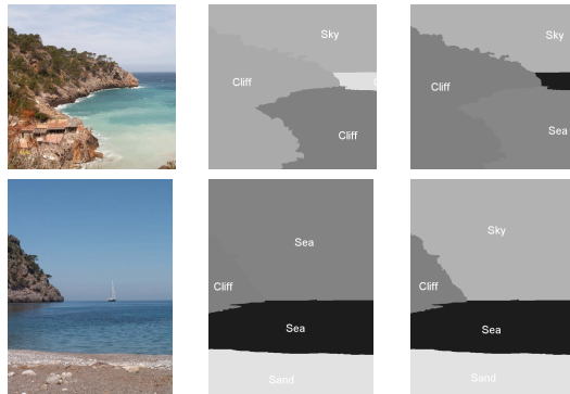
Fig. 2. Exemplar results for the beach domain, depicting the original image, and the GA application without and with context utilization.

where I_{min} is the sum of the minimum degrees of confidence assigned of each region hypotheses set and I_{max} the sum of the maximum degrees of confidence values respectively.