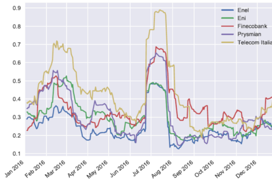
Fig. 1. A cluster of similarly-behaving companies

Most previous works on clustering stock-market firms showed how custom-made clusters outperform traditional industrial grouping criteria [13, 14]. Our work differs from them in that we move from a static to a progressive clustering approach, which allows us to overcome The big problem found when dealing with financial information: stock markets move fast, financial insights expire and get old very quickly. Our progressive clustering provides fresh suggestions daily.