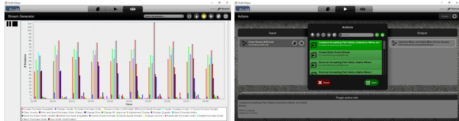
(a) Stream Generator object visualization of active stream. (b) Applying the process discovery algorithms on the live event stream.

The log is imported and a stream is generated using the Generate Event Stream plug-in, setting a default emission speed of 10 data-packets/second. An example of the resulting stream is depicted in Figure 1a. A tutorial for using the