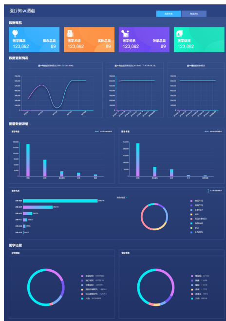
Fig. 2: The dashboard of demonstration

One the second tab, a hierarchical disease tree can be found(Fig.3), which can be folded and unfolded by click.