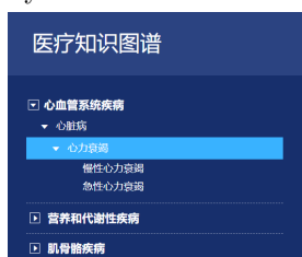
Fig. 3: Hierarchical disease tree

One the second tab, a hierarchical disease tree can be found(Fig.3), which can be folded and unfolded by click.