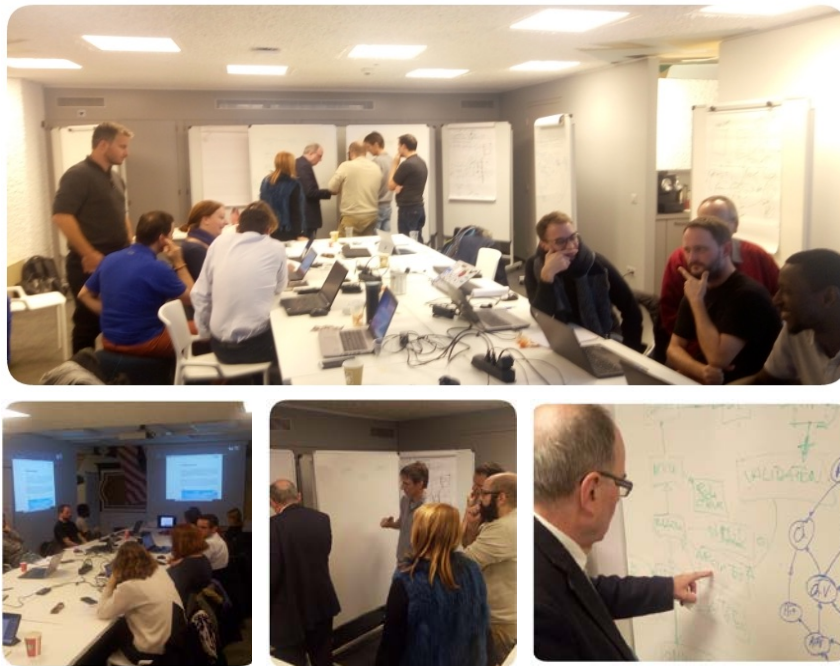
Fig. 1. Pictures from the TLS

Based on our observation and the appreciation of the participants and initiators of the TLS, we consider the results of the two TLS as successful. Participants learned a new approach to co-creating information services that they found very effective. The TLS process also demonstrated that conceptual modeling experts were more efficient than those who did not yet have this capability. We report on these two TLS in the following subsections. Pictures in Fig. 1 illustrate our exploratory TLS.