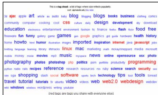
Figure 1. Tags cloud

In the above examples and similar ones, the navigation process is based on clouds of words, called tag clouds , avoiding the taxonomic organization of tags. In Figure 1, we show an example of a tag clouds obtained with the most used tags in del.ici.ous in a particular date. Depending on its popularity (that is, the number of resources annotated with such tag), each word has a different size. Similarly, different colors indicate that tags are shared with other users.