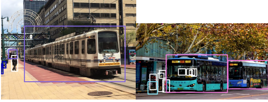
Figure 4: Images actually good, flagged good. CSK-SNIFFER has a high success rate in not flagging images with meaningful bounding box collocations.

each other, such that the AI (CSK-SNIFFER) provides a visual demo of the object detection errors sniffed by spatial CSK, thus generating large adversarial data sets to assist object detection, while the human can use this feedback to enhance the performance of CSK-SNIFFER, thereby playing its role in the learning loop.