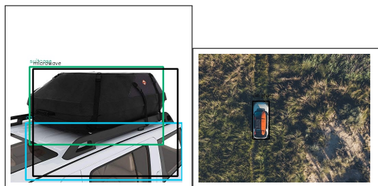
Figure 5: Images with bounding boxes actually bad, flagged good (In the 1st image "suitcase" is also detected as "microwave"; in the 2nd image, "car" is detected as "cell phone").