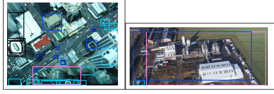
Figure 3: Images actually bad, flagged bad (In the 1st image “buildings” are detected as “truck” and “TV monitor”; in the 2nd image “buildings” are detected as “bus” and “truck”).

On the whole, the human and the AI collaborate with