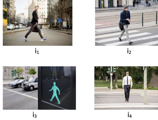
Figure 2: A sample from the gathered images ( X_T ) by searching the Web for "People crossing city streets on pedestrian crossings" in \text{action-vocab}(T)

We present some screenshots illustrating the demo. Many more can be provided in a live setting. The user enters any search query related to smart mobility [6]. Images are downloaded from Google Images based on this query. Object detection is then performed on the images using YOLO [10] to start predicting triples in the image using the f(\text{bbox}) function. Once the triples are