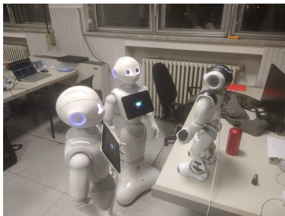
Figure 1: NAO placed on the table to direct its speakers towards the two Peppers' microphones

sentence always considers its action as a success, the other agents may judge outcomes differently. For instance, the distance between the speakers of a robot and the microphones of another robot, or the fact that NAO's and Pepper's microphones are placed over the robots' heads, may lead the speech recognition systems to fail.