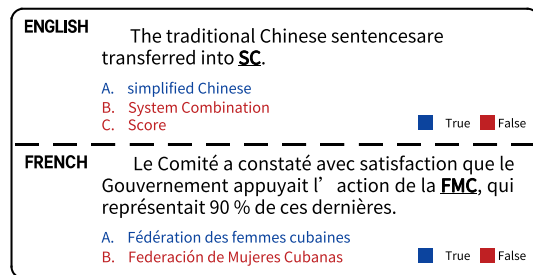
Figure 1: Differences and challenges between English and other (such as French) phrases in the acronym disambiguation. Red means wrong, green means right. Acronyms in English are often first letter acronyms, but not in other languages.

In the datasets, 30,237 data in the four fields of English (science), English (legal), French and Spanish were given. Each datapoint contains a sentence and there will appear a word that is the first letter abbreviated. The task hopes to find the most suitable form of an extension for the first letter abbreviation.