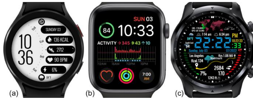
Figure 2: Example of sports smartwatch faces. Watch face design by: a) JN-Rolling (JN-WatchFaces), b) New Design (Enid Rodriguez), and c) Voyager GPS-01RB Sport 24H (Luke Time) from Facer App [45].