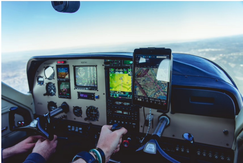
Figure 1: A consumer tablet with a navigation app is usually the most advanced technology support that general aviation pilots have.

pilots require to log for maintaining their flight permissions. In the US for example, GA pilots are only required to take a biennial flight review to maintain their privileges [8]. They are not obliged to spend more time in the air. In addition, GA planes, often single-piston aircraft with two to six seats and an average age of 38 years [3] in the US, are still a major part of the worldwide GA fleet. In many cases, a moving map on a tablet, as shown in Figure 1, strapped to the pilot's leg or attached inside the cockpit is the only digital flight support that GA pilots get in their single-pilot operations [9]. Yet, the interaction with such devices in the GA aircraft is heavily limited for several reasons: (1) the noisy environment renders voice interaction ineffective; (2) shaky and turbulent operations in small aircraft impact the efficiency of touch interactions; (3) consumer tablet screens are difficult to read in bright sunlight, especially in the air; and (4) two-dimensional displays fail to render the full spectrum of information present in the three-dimensional maneuvering space.