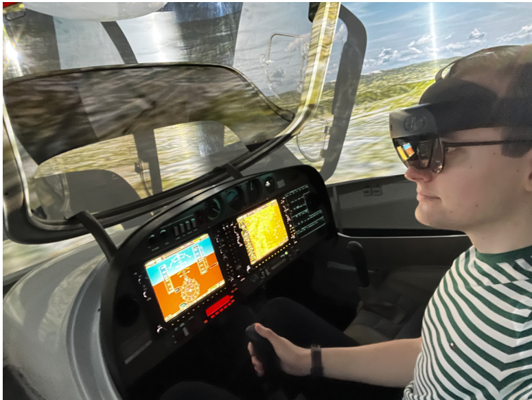
Figure 2: Picture of a pilot who tests the interaction with augmented en-route flight information through a mixed reality headset in a high-fidelity Diamond DA 40 simulator.

even more limited: not only is voice interaction not an option, mixed reality headsets do not offer a touchscreen, and gaze and gesture control have shown to be inefficient.