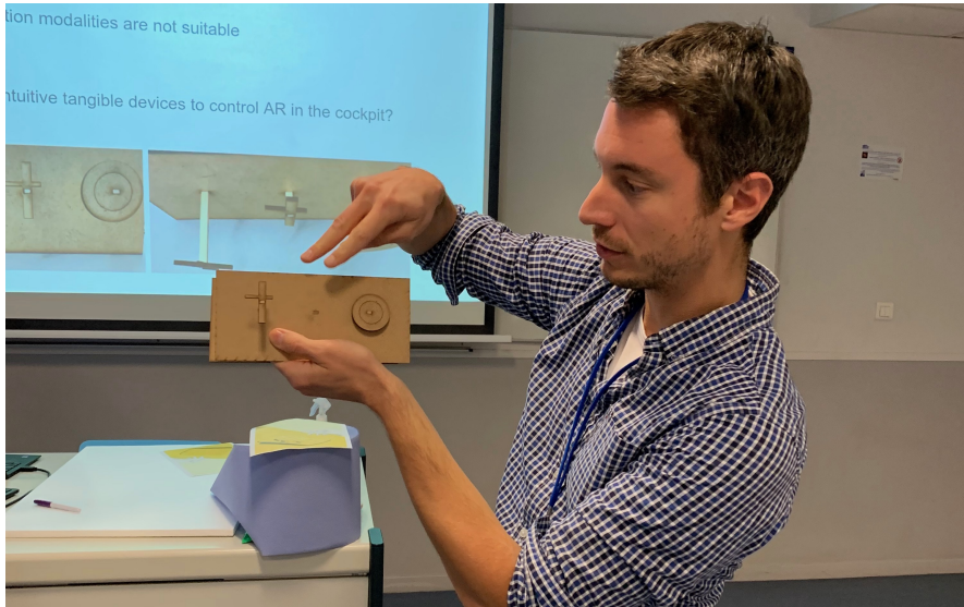
Figure 4: These control elements make use of metaphors that are well-known to GA pilots and allow to control the information density in GA AR experiences.