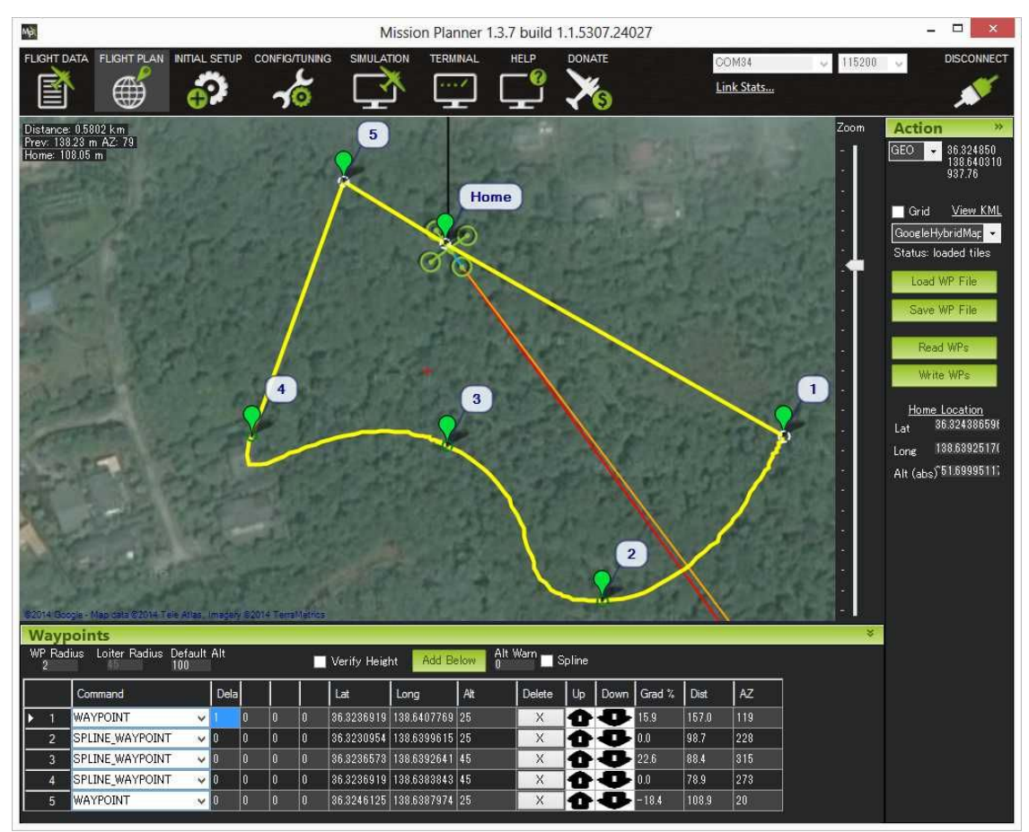
Figure 2: Shaping of a spline trajectory by changing the coordinates of a waypoint

The indicator of the ability to manage (AM) in a situation (s) is determined by the expression: