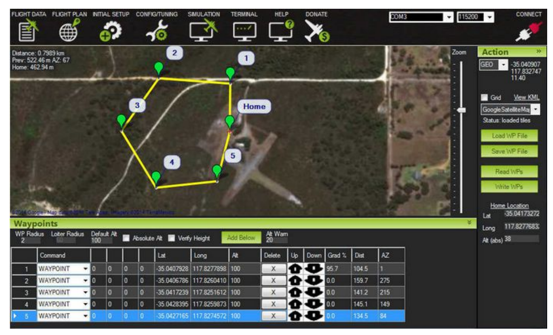
Figure 1: Setting waypoints on the example of Mission Planner in ArduPilot