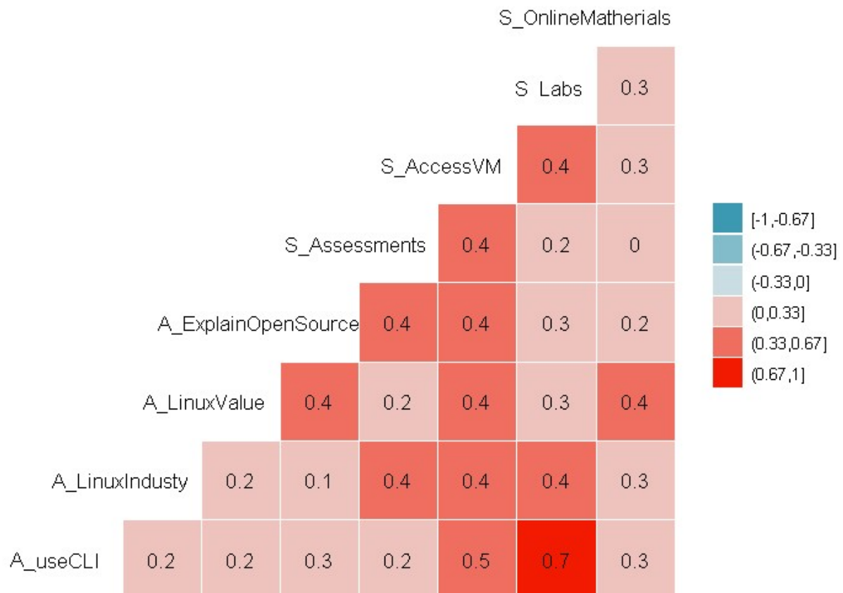
Figure 4: The generalized correlation pairs plot.

understanding of the ideology of open-source software, the fundamental principles of Linux, and the development of skills in using CLI and GUI in different distributions and environments.