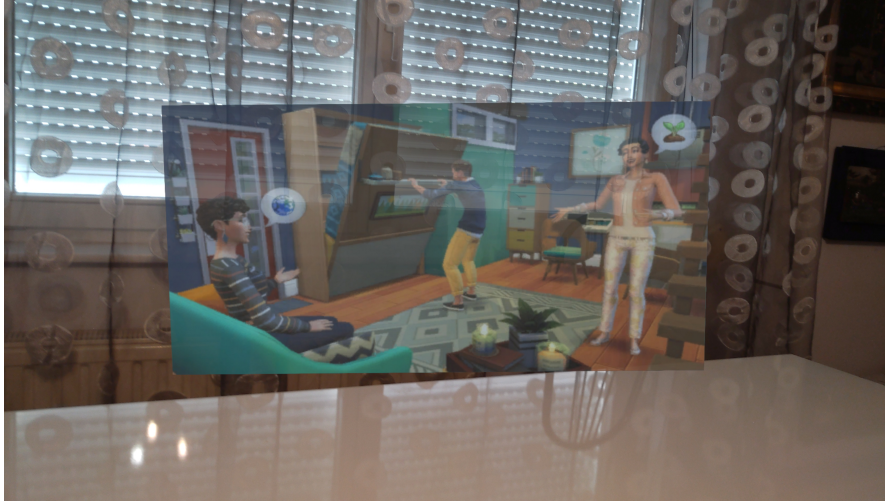
Figure 1: View from the patient's perspective: Describe the image within 1 minute.