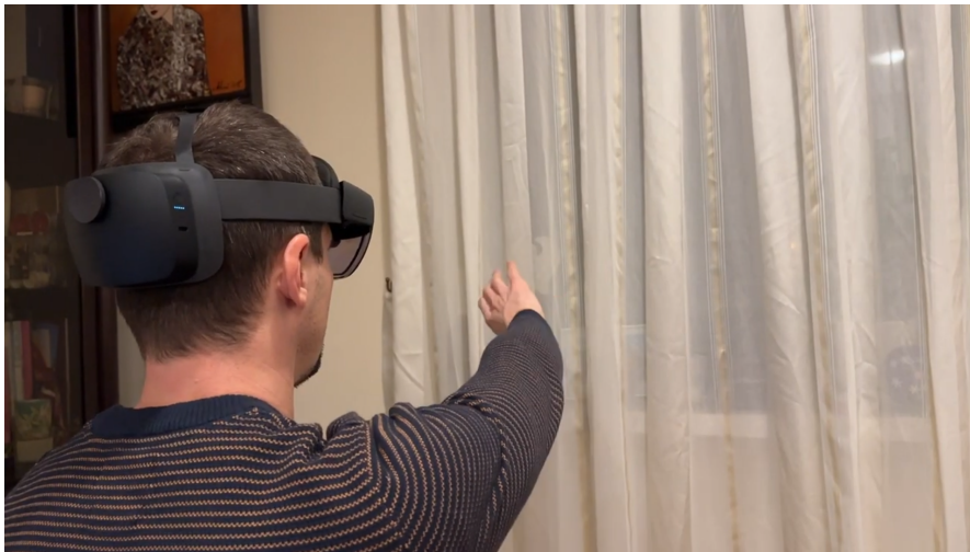
Figure 2: Patient performing movement task.

communication. Our preliminary findings indicate that patients, when engaged in the AR setting, experience a diminishment of the usual test-related stress. This reduction in anxiety leads to a more willing communication, increased motivation, and notably improved performance. The incorporation of 17 varied tasks not only maintains patient interest but also acts as an effective diagnostic instrument, offering doctors a detailed insight into different neurological facets.