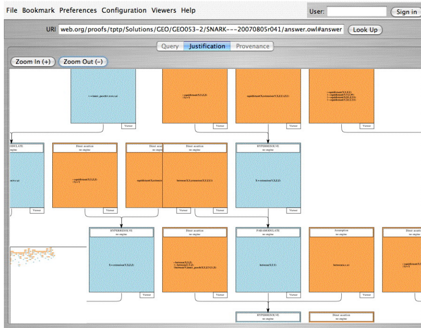
Fig. 4. Probe-It! presentation of SNARK's proof of GE0053-2

1 - 100 of total 456 results for agatha in 0.938000233650208 seconds