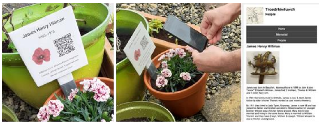
Figure 2: Early working prototype for open day

Based on the outcomes of these stages three aspects moved to a second level of development. TalkOver is an application designed to help people talk about digital photographs recording both what they say and also what they point at in the photo [4]. Also, a group of PhD students have 3D scanned many of the items transferred from Troedrhilwfwch church to Pontlottyn church and created a VR gallery. The third, was the QR-code based signage, which is the focus of this paper.