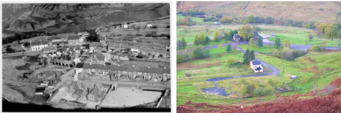
Figure 1: Troedrhiwfuwch before and after evacuation and demolition

One of the few remaining landmarks is the War Memorial, which commemorates the exceptional sacrifice of young lives during the First World War especially, when over one hundred young men went to war, more than one per household, and of these more than twenty never returned. For many, the War Memorial is the only physical reminder, as their relatives' bodies were never recovered. This has become one of the major foci of local interest, with community members developing extensive expertise digging into war records, census returns, and other sources.