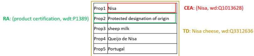
(b) Entity Table.