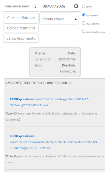
Figure 2: The first results of our search by topic system. Using the query “land consumption” in Italian on the Normattiva dataset, the system returns the appropriate Camera commission (environment, territory and public works) and the first two results are relevant (one is about waste management, the other about rocks and earth from excavation projects).