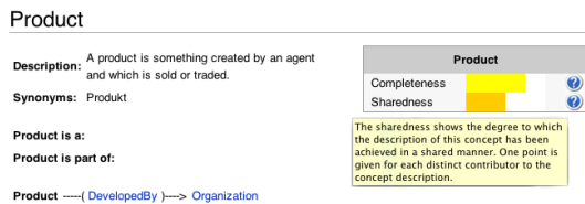
Figure 2: Quality indicator on a concept page.