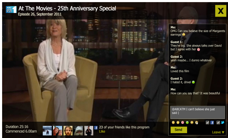
Figure 3: Program player and chat functionality.

Clicking on the icon launches the video player with standard control buttons and time indicators (see Figure 3). Users may participate in a live chat that is visualised in a semi-transparent manner and overlaid on top of the video content of the program. Although the chat is limited to users watching the program with the Social TV prototype, users can also choose to publicly post their comments to widespread social media platforms by ticking the respective checkboxes.