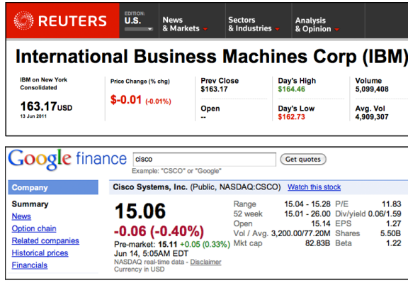
Figure 1: Two web pages containing data about stock quotes from Reuters and Google finance websites.

However, due to errors introduced by the publishing process, instance-based matching is challenging because the sources may provide conflicting values. Also, imprecise extraction rules return wrong, and thus inconsistent, data.