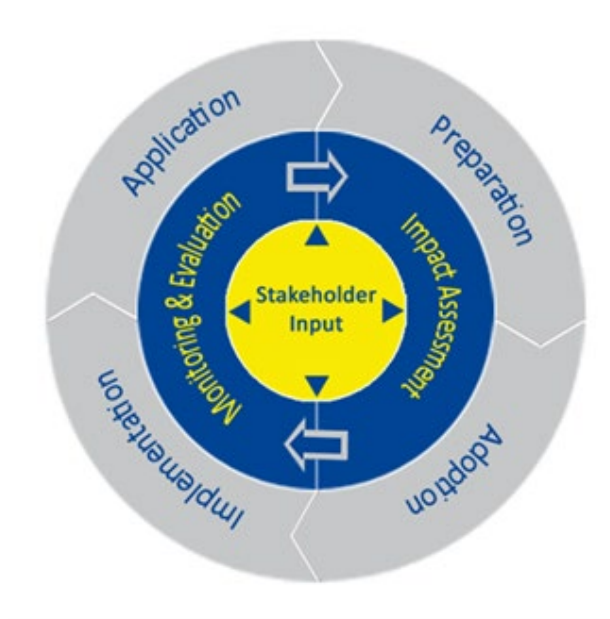
Figure 1. The EU policymaking cycle

‘Better regulation’ covers the whole policy cycle (see Figure 1), from policy design and preparation, through adoption, implementation (transposition, complementary non-regulatory action) and application (including monitoring and enforcement) to evaluation and revision. For each phase, there are relevant ‘better regulation’ principles, objectives, tools and procedures to make sure that the EU develops sound, evidence-informed policies. The following sections cover the main instruments of ‘better regulation’.