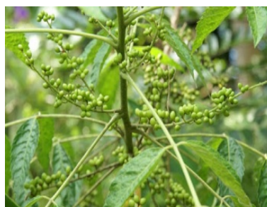
Brucea sumatarana Roxb.