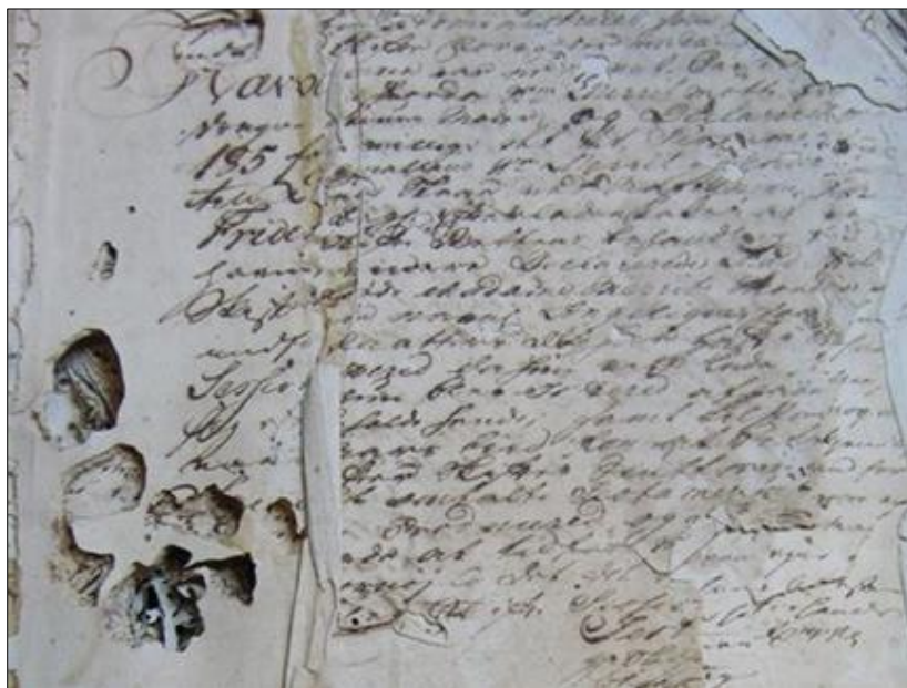
Figure 2 Historical documents

In the last decade the technology has advanced mainly in two areas, computers and communication. This advancement has resulted in creation of a platform called Internet today. The invent and accessibility of internet has provided the opportunity to make this literature available to the people from all around the world. By developing image databases of these manuscripts and documents and making them available on the Internet it will be easier for the people to access them. Another significant advantage of image databases is we can save the documents from further degradation by preserving them and at the same time ensures their perpetual accessibility to the users. So, we are able to access images of historical artwork such as old paintings, sculptures, prints etc. through the digital libraries.