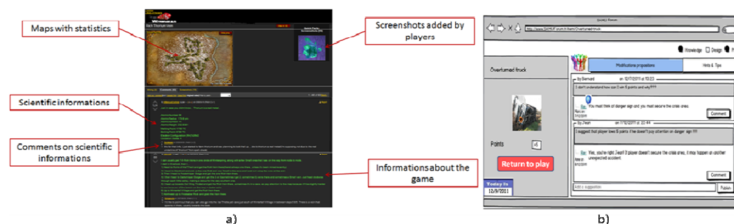
Figure 3. a) The WOWHEAD-Forum page dedicated to the "thorium"; b) the A.R.G.I.L.E learners forum

A When the rule "is released ", the discussion which it caused is available in the game scene: we suggest to the player-learner the he can investigate rules attached to scene objects the learner is encouraged to mobilize the rule and it discussion thread as resource "to play better".. The means for that is a "learner's forum", combined with the precedent "design forum". In that matter lessons can be learned from MMORPGs (Massively Multiplayer Online Role-Playing Game Play). The MMORPGs are a type of video game that allows many players to simultaneously interact in a virtual persistent world. Players' discussion forums are increasingly used by the MMORPGs Players' Communities. Figure 3 shows a part of the "Wowhead forum", created by World of Warcraft (WOW) players. This page is dedicated to the "Thorium 4 " topic. The complete page contains hundreds of knowledge elements like comments, discussions; screenshots ... This example is similar to what we want to do with "participative rule".