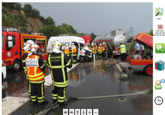
Figure 1. Crash between a tank truck and a van (image proposed to the learner in the serious game)

Crisis management is complex and we do not aim at its complete characterization, but rather outline general issues for designing serious games useful for preparedness. Let's use a simplified example to help us in this task. The worked example is real; it's the result of interviews we conducted with trainers at the mobile Emergency Medical Service (EMS) in the (middle town -150 00 inhabitants) hospital participating in our project. During a winter Sunday, a tank truck transporting potentially toxic material has an accident with a van (see figure 1) on a national highway 25km from the EMS basis. If this toxic material gets in contact with air, it causes a major air contamination. The situation requires the coordinated intervention of multiple units: firefighters trying to avoid contamination; medical units taking cares of victims and police trying to avoid traffic problems. So, we are dealing with a complex problem, and we have different solutions with associated costs and risks.