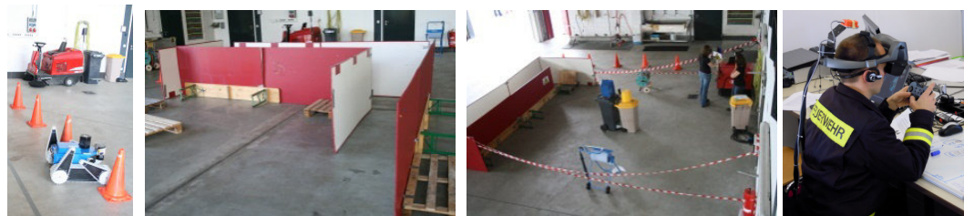
Figure 1: a) slalom task, b) narrow hallway and stop before collision task, c) detect objects task, d) operator controlling robot with game controller and head mounted display (Mioch et. al, 2012).

results of the experiment showed that the difference in collisions (SA measure) in the detect objects task explained 40% of the variance in the scenario. For performance a correlation was found between the number of collisions in the detect objects task and the scenario. Furthermore, individual differences turned out to influence performance and SA both in the unit tasks as well as in the scenario. In summary, the detect objects task is most capable of predicting SA in the scenario. However, individual characteristics may not be ignored.