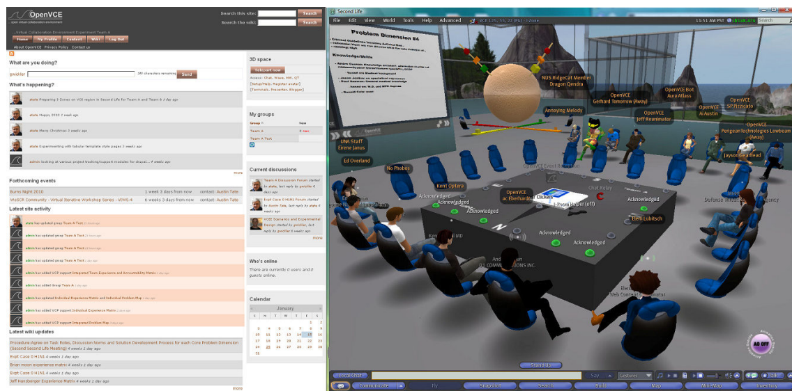
Figure 1. OpenVCE Website and 3D Virtual Meeting Space

The OpenVCE project [Hansberger, 2010; Wickler et al., 2013] aimed to develop an open virtual collaboration environment that facilitates collaborative work in a virtual space. The OpenVCE space consists of two linked environments: a dynamic website and a 3D virtual world space for meetings [Tate et al., 2009] as shown in figure 1. The left-hand side shows the Drupal- and MediaWiki-based website with recently added posts, and the right-hand side shows a virtual meeting in Second Life with a screen showing automatically generated information. This environment could, for example, be used to collaborate on the development of procedural knowledge, or it could be used during an actual emergency to manage information and courses of action. In fact, this environment contains a specific piece of software that supports these two functions: the <I-N-C-A> extension for MediaWiki.