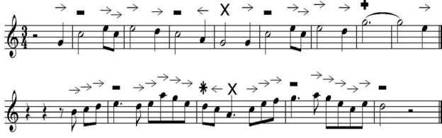
Figure 1: Amazing Grace (top) and Danny Boy (bot) showing the note-level labeling of the music using symbols from A .

describing the role the note plays in the larger context. These labels, to some extent, borrow from the familiar vocabulary of symbols musicians use to notate phrasing in printed music. The symbols \{l^-, l^x, l^+\} all denote stresses or points of “arrival.” The variety of stress symbols allows for some distinction among the kinds of arrivals we can represent: l^- is the most direct and assertive stress; l^x is the “soft landing” stress in which we relax into repose; l^+ denotes a stress that continues forward in anticipation of future unfolding, as with some phrases that end in the dominant chord. Examples of the use of these stresses, as well as the other symbols are given in Figure 1. The symbols \{l^-, l^*\} are used to represent notes that move forward towards a future goal (stress). Thus these are usually shorter notes we pass through without significant event. Of these, l^- is the garden variety passing tone, while l^* is reserved for the passing stress, as in a brief dissonance, or to highlight a recurring beat-level emphasis. Finally, the l^{\sim} symbol denotes receding movement as when a note is connected to the stress that precedes it. This commonly occurs when relaxing out of a dissonance en route to harmonic stability. We will write x = x_1, \dots, x_N with x_n \in A for the prosodic labeling of the notes.