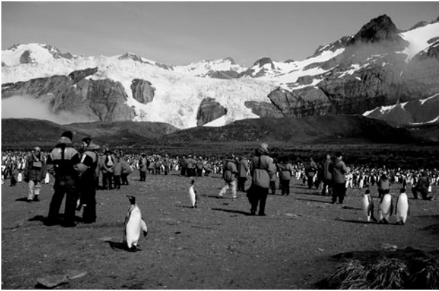
Fig. 3. Tourists and penguins at Gold Harbour, South Georgia.