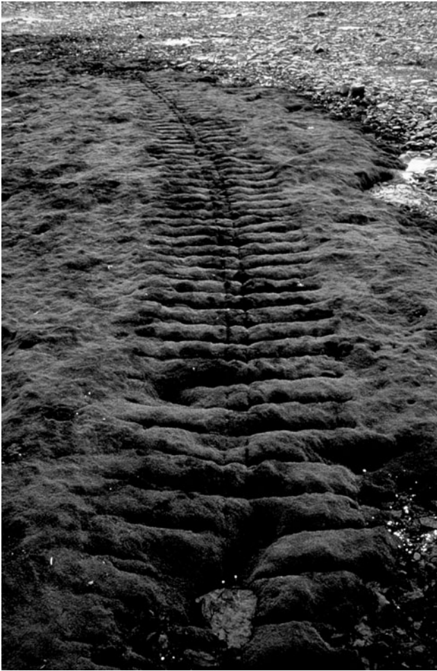
Fig. 2. Bulldozer tracks over a moss patch on Fildes Peninsula.

(Poland et al. 2003). It is our opinion that this is likely to reflect a historical lack of coordinated scientific study rather than a lack of disturbance per se . It has been stated that direct impacts on Antarctic terrestrial ecosystems are relatively minor (Huiskes et al. 2006); however, such simple statements can lead to possible misconception. It is true in an absolute sense that, by metrics such as the area of ground affected or the number of humans involved (direct “footfalls”), impacts can be described as restricted. On the other hand, only about 0.34% of the Antarctic continental area is ice free, and it is here that most research stations are built. Human activities inevitably compete with terrestrial ecosystems, as well as seals and seabirds, for the small areas of ice free ground available, intensifying the pressure on individual sites at a local scale.