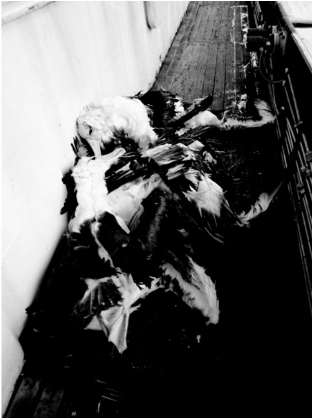
Fig. 5. Black browed albatross killed in an Antarctic longline fishery.

( Gobionotothen gibberifrons (Lönnerberg)), the Scotia Sea icefish ( Chaenocephalus aceratus (Lönnerberg)) and the South Georgia icefish ( Pseudochaenichtys georgianus Norman; Gon & Heemstra 1990, Kock 1992).