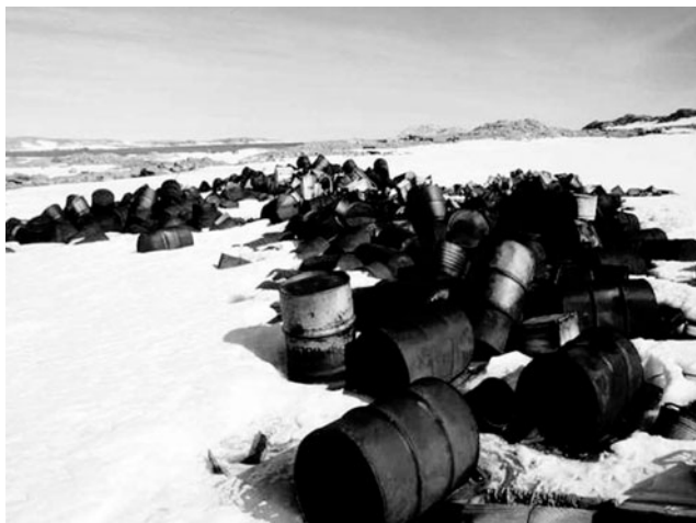
Fig. 1. Waste disposal site at the abandoned Wilkes Station.