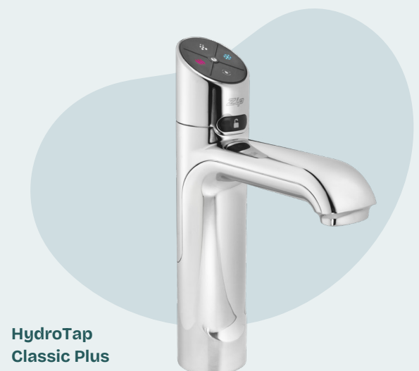
HydroTap Classic Plus