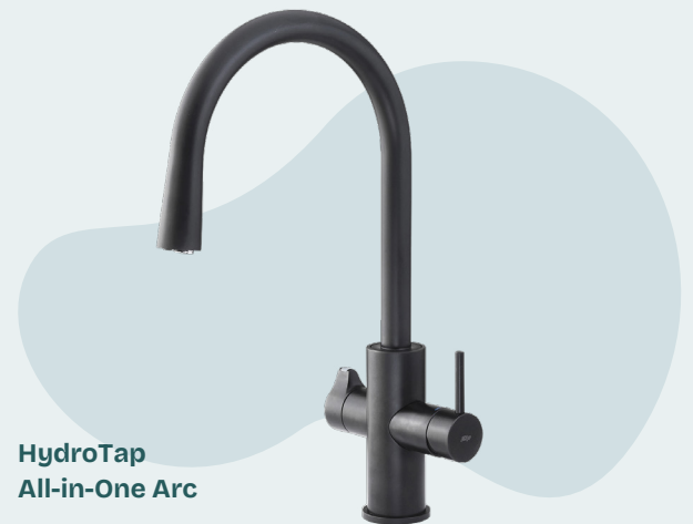
HydroTap All-in-One Arc