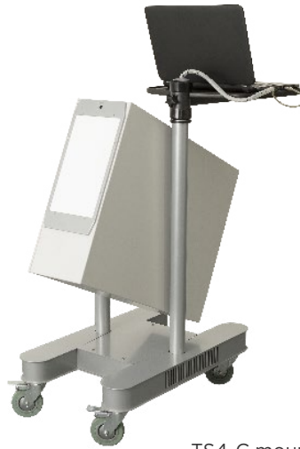
TS4-C mounted on Mobile Operator Station for easy deployment