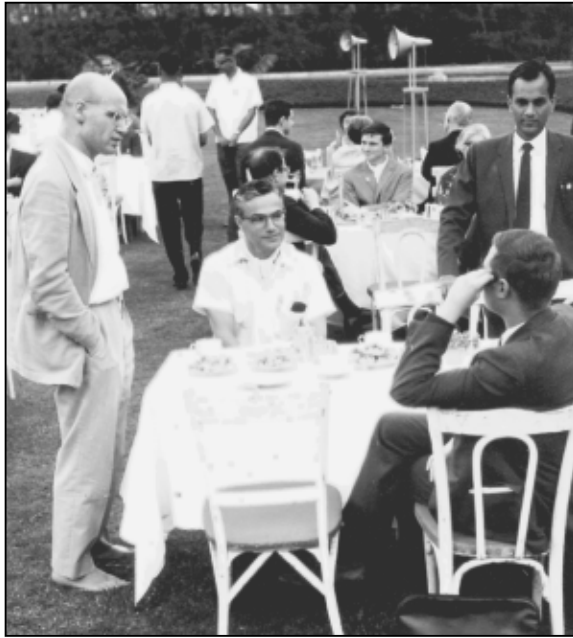
Tata Institute International Colloquium in 1968. Grothendieck (standing, left) and Armand Borel (seated, facing camera).

for the survival of the human race against environmental degradation and the dangers of military conflict. This group, called “Survival” (“Survivre et Vivre” in French) came into being in July 1970 when Grothendieck delivered his Orsay lecture a second time, at a summer school on algebraic geometry at the University of Montreal. The main activity of Survival was the publication of a newsletter by the same name, the first issue of which was written in English by Grothendieck and is dated August 1970. The newsletter describes an ambitious agenda of publication of books on science, organization of public courses on science aimed at non-experts, and boycotts of scientific institutions that accept military funds.