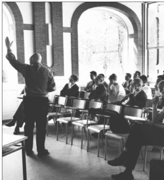
Grothendieck lecturing at the IHÉS.

Grothendieck had a flair for choosing striking, evocative names for new concepts; indeed, he saw the act of naming mathematical objects as an integral part of their discovery, as a way to grasp them even before they have been entirely understood ( R&S , page P24). One such term is étale , which in French is used to describe the sea at slack tide, that is, when the tide is neither going in nor out. At slack tide, the surface of the sea looks like a sheet, which evokes the notion of a covering space. As Grothendieck explained in Récoltes et Semailles , he chose the word topos , which means “place” in Greek, to suggest the idea of “the ‘object par excellence ’ to which topological intuition applies” (pages 40–41). Matching the concept, the word topos suggests the most fundamental, primordial notion of space. The