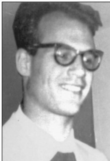
Grothendieck in a photograph from the 1950s.

In Récoltes et Semailles Grothendieck says that, after he left the mathematical world in 1970, his style of doing mathematics was held in contempt and that many of the paths he had broken went undeveloped. It is true that after that time, research in algebraic geometry began to shift, mixing the highly general approach that characterized his work with investigation of specific problems. Deligne’s proof of the Weil conjecture, which was