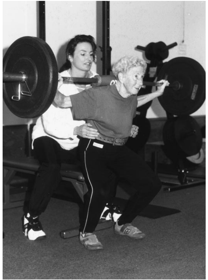
Figure 1. For healthy individuals 50 and over, strength acquired through the power lifts has a high transfer value to dynamic, functional living.

developed in a 13-year weight-lifting career could be regained 16 years later at the age of 51. A 1-year, periodized powerlifting program was instituted, with full squats as the cornerstone of training. Squats placed the training emphasis on the large muscle groups of the hips, thighs, and lower back, while periodization helped avoid the pitfalls of a hit-and-miss training program. Dynamic strength increased to levels comparable to lifts performed during the subject's competitive days, with a full squat, bench press, and deadlift of 215, 105, and 250 kg, respectively, at a bodyweight of 85