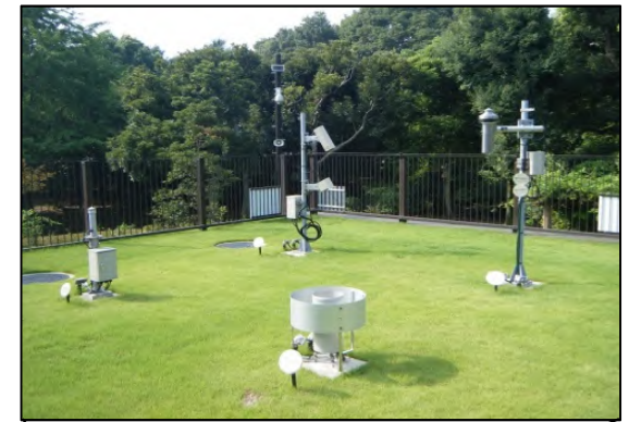
The new Tokyo observation site

http://www.jma.go.jp/en/amedas_h/today-44132.html?areaCode=000&groupCode=30