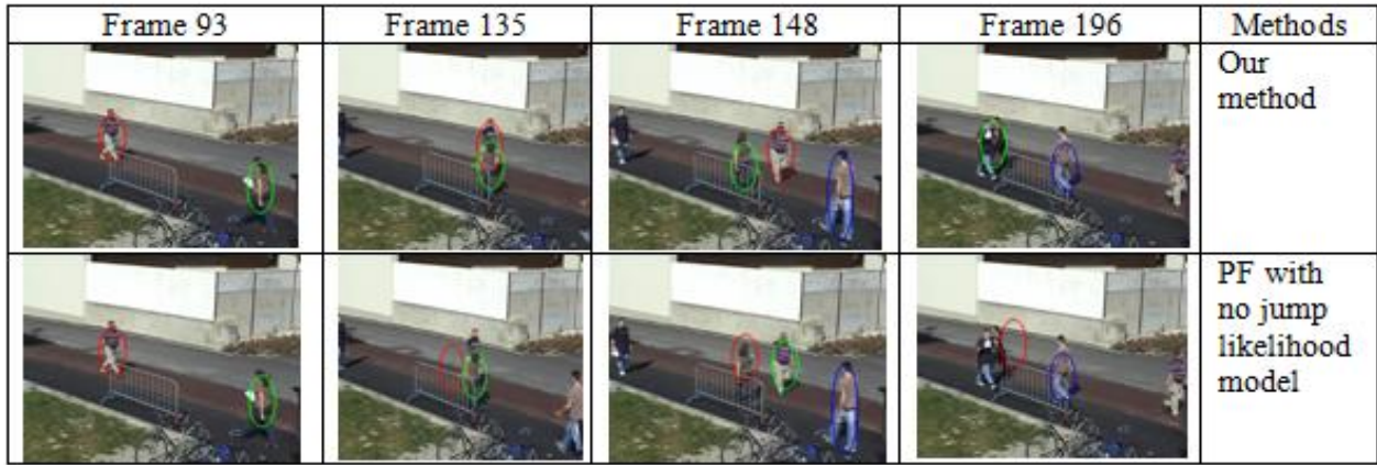
Figure 2. Results of multiple object tracking on EPFL data