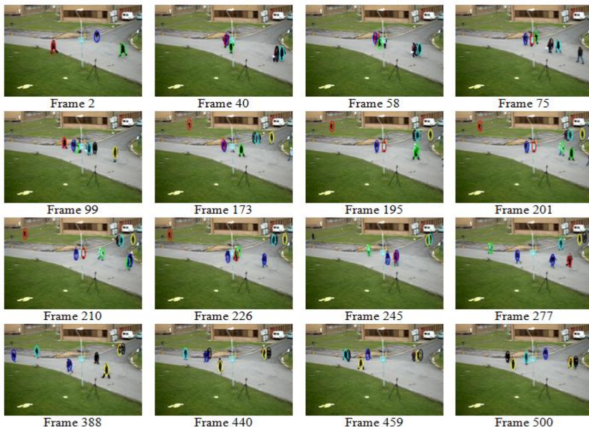
Figure 4. Results of multiple object tracking on PETS data

cases such as three occluding persons from frames 40 to 173, two occluding persons in frames 226, 440, etc. Based on the sequential particle filter with the jump likelihood model, occluded persons can employ observations from visible persons. Hence, tracks of persons are maintained. Figure 4 shows that our method can handle efficiently this scenario.