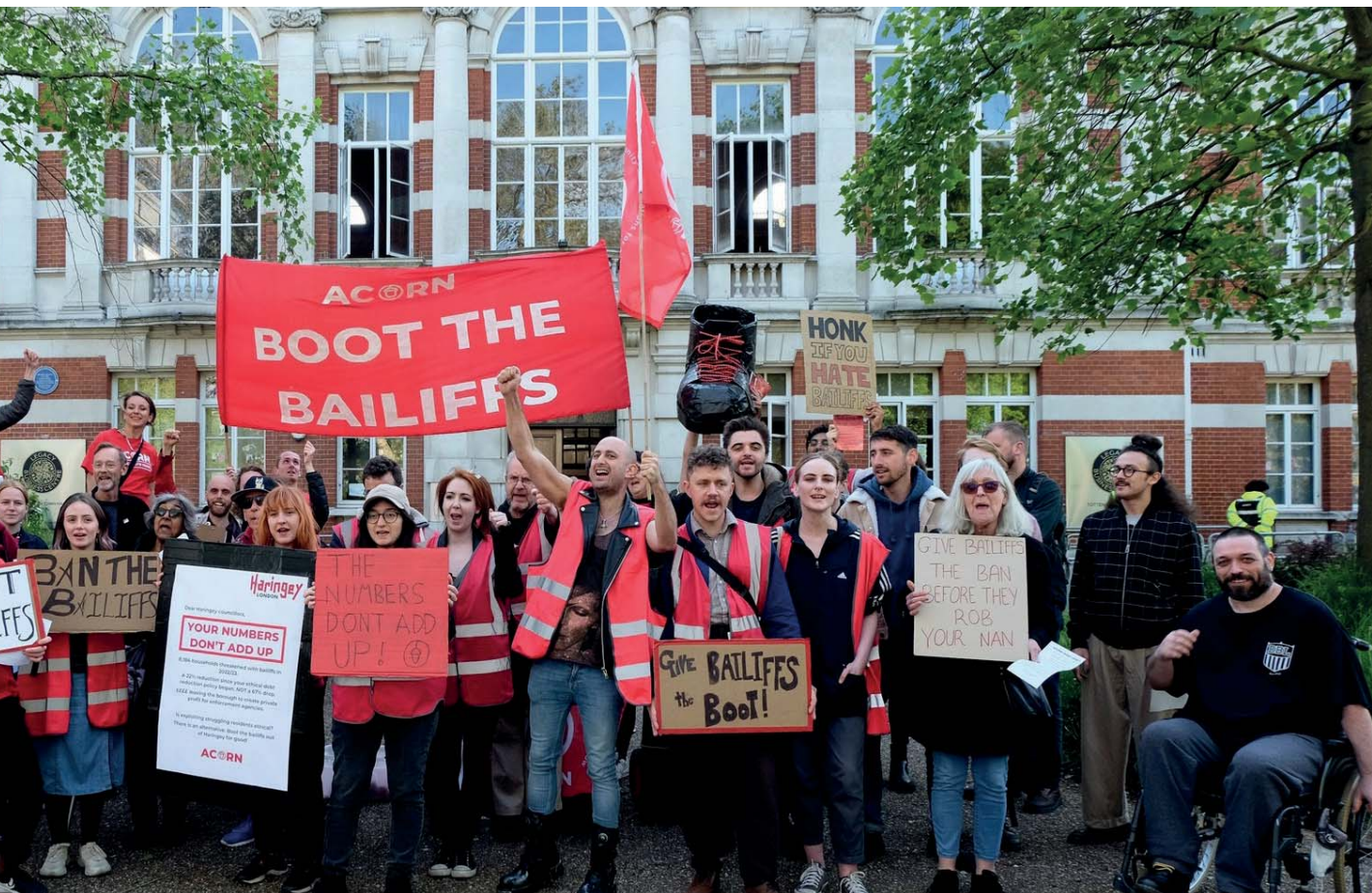
Members of the Acorn tenants' union stage a protest against evictions in Haringey, London

of housebuilding were routinely achieved, and during which housing was often much more affordable.