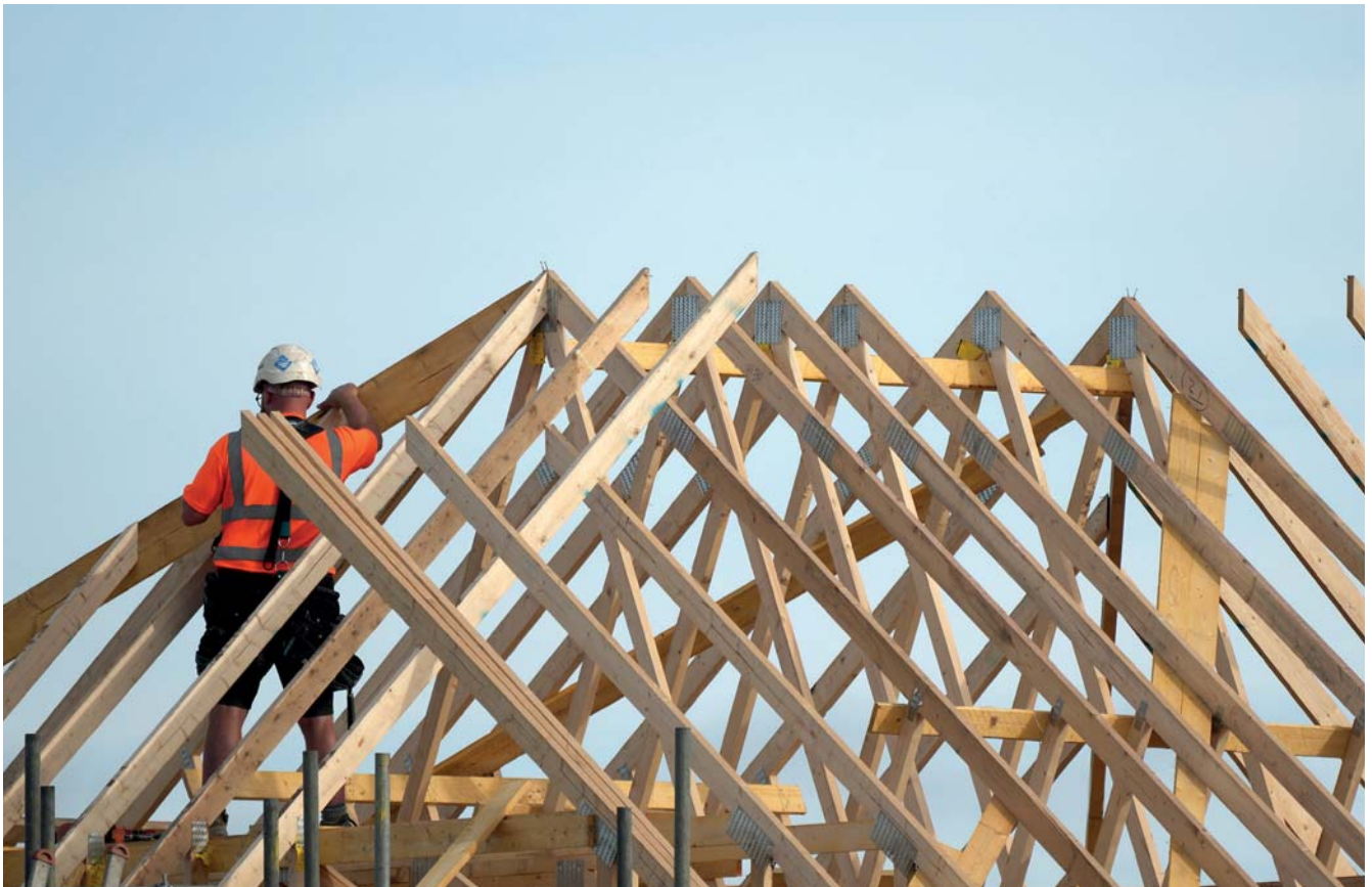
Capacity issues at English councils' planning departments will have a direct effect on Labour's ability to build 1.5 million homes

intentions, but capacity challenges and low wages can quickly skew their perspective. "A lot of graduate planners go into public sector planning thinking they're doing good for society," they said, "but a lot of times they're not actually doing planning – it's more like paper shuffling."