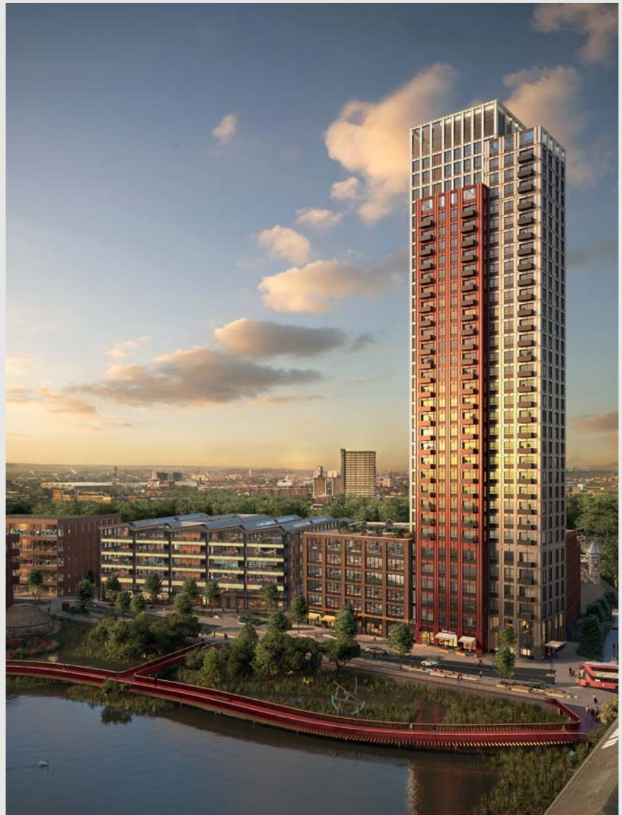
An illustration of British Land and AustralianSuper's Canada Water development, London

Other announced measures in the Budget including extending the mortgage guarantee scheme to support lending at a higher loan-to-value, at the lower end of the market, and enabling local authorities to retain and invest 100 per cent of right-to-buy receipts will