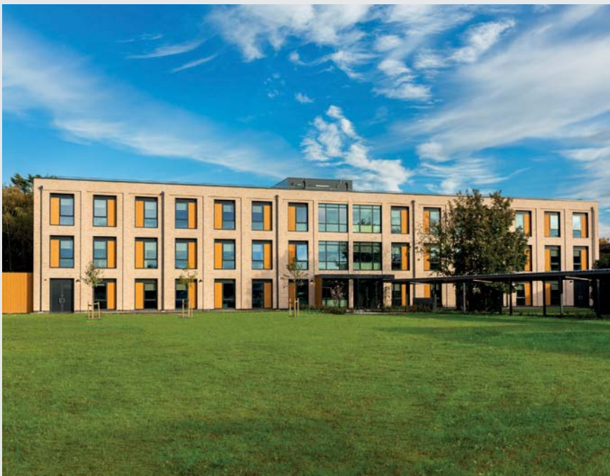
Reds10's award-winning Imjin Barracks in Gloucestershire is made using MMC

Learn more about how Redzio is transforming construction and delivering amazing spaces for people to live, learn and thrive, here: www.redzio.com