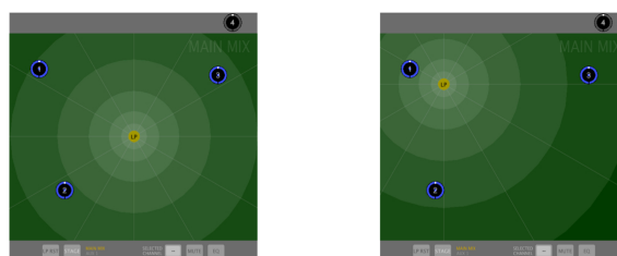
Figure 2: Two different mixes achieved by moving the Listening Point .

Speaking in traditional mixing terms, the destination of the mix of a number of channels is called a mixing bus (the main mix, an auxiliary send, a recording bus, etc.). Electrically, this is just the cable that takes the electric signal from the summing circuit to the output connector [3]. We suggest the use of a metaphor for the bus in the interface. When mixing, we are going to locate sound sources in a sound space, or a stage (which represents the physical space, such as a studio or a live stage). Therefore, in our interface, each stage represents a possible destination for a sum of channels . For example, the main mix is one stage, an auxiliary mix for instrument monitoring could be another one, an auxiliary mix for a reverb effect could be yet another one and so on. Two stages were implemented in the prototype, a “Main Mix” and an “Aux 1” mix for adding a reverb effect. Every stage has a listening point (LP), and the panning of every channel present in the stage is determined by its position, relative to the position of the Listening Point. The Listening Point can be dragged around the stage with a two finger drag (to avoid accidental moves with a single finger). This way, it is easy to create custom mixes based on a reference mix without having to move every channel (Figure 2).