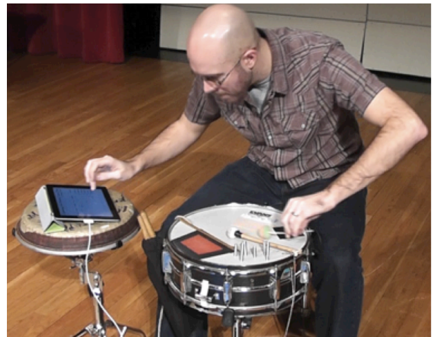
Figure 3. Prepared snare drum and iPad positioned for performance. Visual interface on laptop computer screen (cropped out of picture) is centered below and in front.

including the effect level and delay time. If the performer changes the delay time, after several seconds, it will gradually sweep back to the default delay time, which eases the workload of the performer and facilitates the utilization of accelerating and decelerating rhythmic effects. Although these audio signal processing algorithms are relatively simple, but quite flexible, the performer can predictably combine multiple iPad control gestures with various percussive gestures on the prepared snare drum to synthesize a great variety of both static and transitioning timbres, ranging from acoustic to electronic, pitched to indefinitely pitched, metallic to wooden, and inharmonic to harmonic spectra.