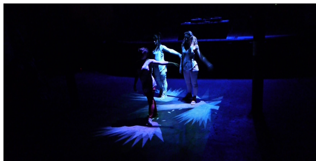
Illustration 1: synchronized flocking

In several sections, a group of dancers performs some variation on flocking behaviour [8, 9]. Here, 'flocking' refers both to the movement of the dancers through cartesian space (as in 'boids'), and also to gestural imitation. Because the dance is improvised, and there is no established leader overall, the dancers must continually examine each other for behavioural cues in order to maintain synchrony. This arrangement is reminiscent of the famous Asch conformity experiments [1], in which test subjects are shown to conform with the behaviour of their peers in unfamiliar situations, even when that behaviour is odd or illogical. Sometimes the aim is to maintain synchrony, and at other times the goal is to deliberately violate it in certain ways, thereby expressing deviance. Often, the moment to moment expression is the result of creative interplay amongst the dancers. For instance, a dancer who has established momentary leadership might abruptly perform unusual maneuvers in an attempt to make one of the others lose synchrony. At other times, a dancer will fall into the others, in a devious violation of the 'separation' rule of flocking, and the others would catch and physically expel her in an attempt to uphold the rule.