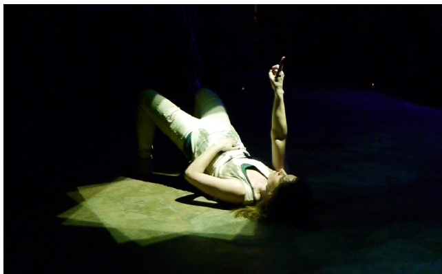
Illustration 3: dancer signaling the number one

Another solo section represents a model of behaviour in which overbearing or uncomfortable social situations routinely force an introvert to revert to a single comforting solitary activity, which is typically an addiction [11]. The dancer represents this in a highly abstract way. She chooses one simple gesture, and improvises a dance based entirely on variations on this gesture. The gesture, which involves her signaling the number one with her hand, represents the single, comforting behaviour, and she makes departures from and calm returns to this gesture. The sensing is performed by tracking the dancer's overall speed in cartesian space, as seen from an overhead camera. There may exist more appropriate methods of sensing this dance. For instance, if the basic gesture were known in advance, skeletal-tracking could have been employed to determine her instantaneous degree of similarity between the observed movement and a template of the basic gesture. However, this was, for a variety of reasons, out of scope for the project. Nonetheless, because the basic gesture is always performed while essentially stationary, and the dancer's departures from the basic gesture are always accompanied by bursts of velocity (or changes in blob shape, as discussed above), this functions as a passable metric of the idea being expressed.