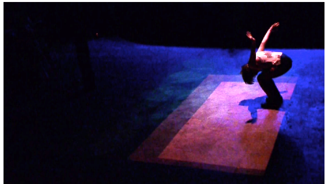
Illustration 2: dancer emerging from the 'introverted' pose