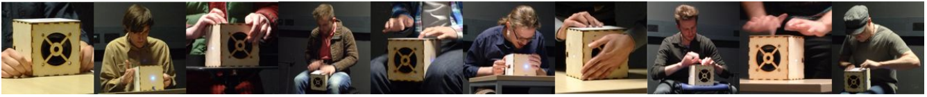
Figure 1: Pictures taken during the second performance, showing different ways of playing the instrument.

signed to discourage musicians from playing melodies on the instrument. Conversely, the pitch range was continuous rather than rounded to discrete semitones; this was done to provide both pitch and timbre controls with similar sets of degrees of freedom and constraints.