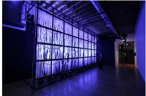
Figure 1: endo/exo, installed at the David B. Smith Gallery

seen in silhouette. The silent interior, a volumetric textile membrane, is glowing with intense, continuously modulated color, and is constructed with soft materials that have been worked by hand into a web of amorphous shapes.