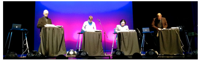
Figure 3: LOLs Performing Recombinant Features .

sition was a quartet piece of four Pitch Canvases at different tunings and transpositions. It was a structured improvisation in two parts taking advantage of the rhythmic qualities of the tap-based attack, and the organic sound of swirling multiple fingers slowly across the canvas.