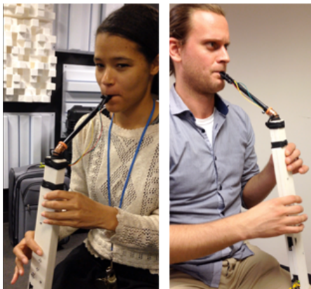
Figure 3: Experts testing Birl prototype

During testing, OSC data from the birl was sent to a laptop computer running OS X. On the computer, the training and running of ANNs were handled by the Wekinator software, which then sent parameter data to a Max/MSP patch for audio synthesis. A small buffer size of 64 samples was used to keep audible latency to a minimum. Two synthesis methods were tested — a simple triangle wave with variable FM and a physical model patch, the “blotar”, from PeRColate 6 by Dan Trueman and Luke Dubois.