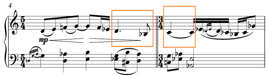
Figure 9. (B-2-3-6-7).