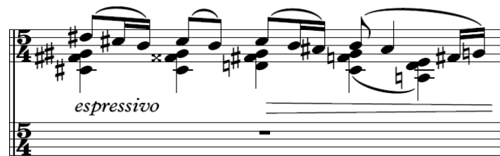
Figure 7. (B-1-2).