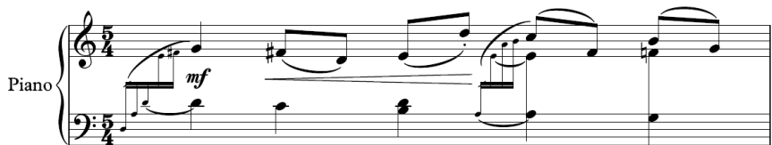
Figure 6. (B-1).