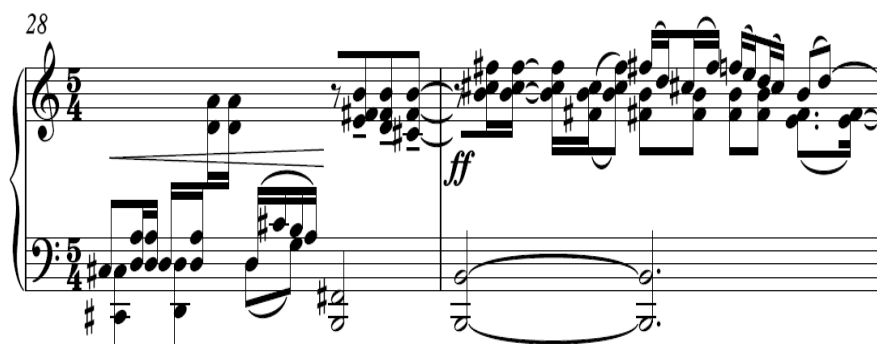
Figure 4. (B-13).

Source: Dve skladbi za klavir/Fantasia rustica . 1970. ED.DSS ŠT. 379. Pg. 6-11.