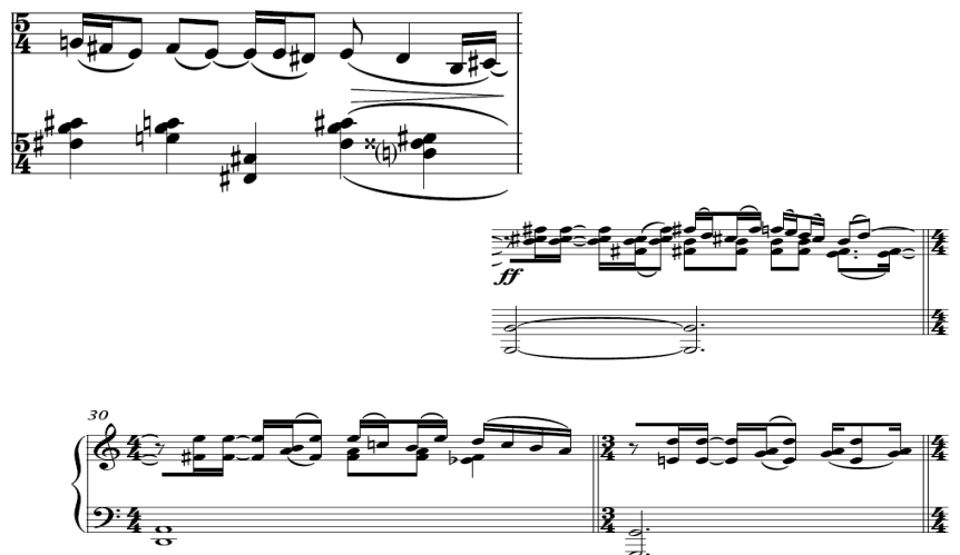
Figure 10. (B-4-5).